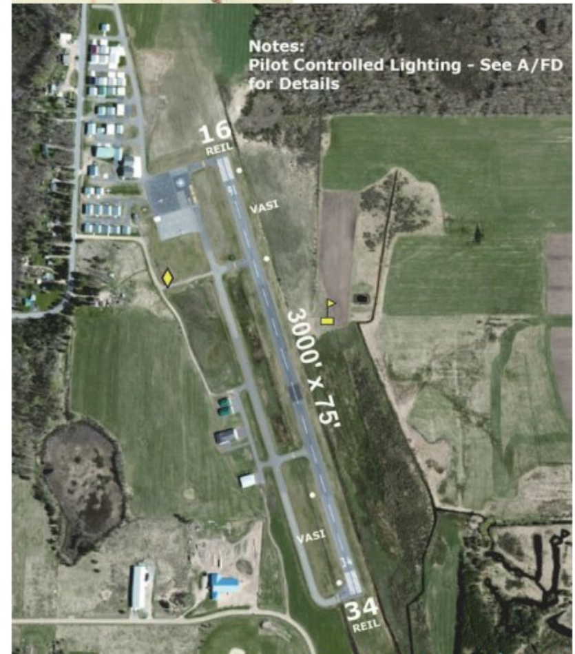
Pine River Regional Airport

SEC. CH: TWIN CITIES LAT: 46-43-29.857N LONG: 094-23-00.979W Approaches: RNAV Calm Wind Rwy 34 COMM: 122.9 (L) WX: VHF 118.525 CTR: 118.05 MSP CLNC DEL: 651-463-5588